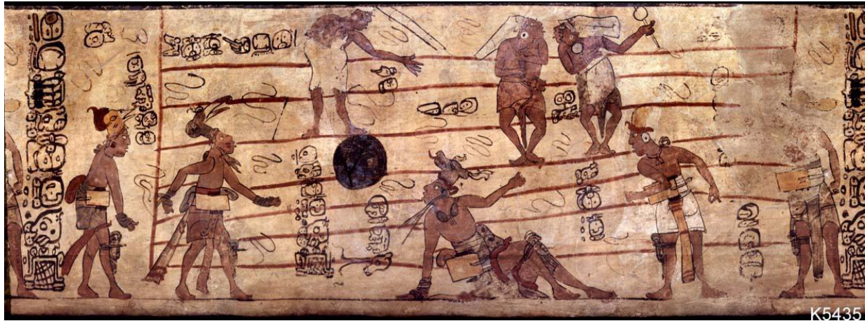
FIGURE 3. Ballcourt echoes were represented as speech scrolls , shown by the stray squiggly lines in this classic period ballcourt scene. Houston-Taube wrote: In one image, set in a ballcourt, the artist showed echo effects in architectural spaces through the expedient of stray speech scrolls detached from human lips (Their Fig 14a). The convoluted, tightly bent, and modulated quality of these scrolls may denote echoing intensity of the sound.”

One Maya name for the ballgame is “pok-ta-pok”, an anamanapoetic word that evokes the sound of hard rubber balls striking stone walls, or possibly ballplayers hard, protective yokes [3]. Compare with the name “ping-pong” for table tennis which evokes the two sounds made when the ball first strikes a players paddle and then the tennis table. Imagine how impoverished the game of baseball would be without the “crack of the bat”. These examples demonstrate that sounds of play are inextricably linked with their games. Such sounds convey information to players and spectators, and increase the enjoyment of play.