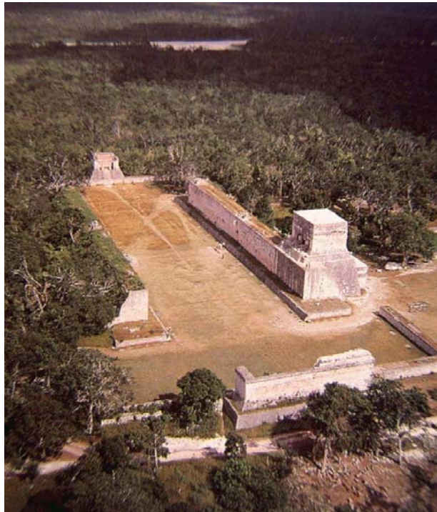
FIGURE 2. The Great Ballcourt (GBC). Observe that the long playing field and the north and south temples are centered on the ballcourts longitudinal axis. The playing field's precisely parallel sound-reflecting walls are central to its whispering galleries, and are responsible for other interesting sound effects heard there. The playing field is modeled as a parallel plate acoustic waveguide. Sound from the temple is captured at the playing field entrance and propagates down its longitudinal axis as a plane wave. This prevents the captured wave from weakening by spreading. Propagation losses from the playing field terminus to the receiving temple is relatively low because the terminus is in the nearfield of the receiving temple.

The two parallel walls comprising its playing field are about 83 m long and about 36.3 m apart. Stages of the north temple (seen at the top of FIGURE 3.) and south temple (bottom) are about 6 m high and 140.2 m apart. Vaulted ceilings of end temples are collapsed, but the back and side walls of the temples remain intact. Temples are centered on the ballcourts longitudinal axis. It's worth mentioning that earlier courts with parallel vertical playing walls like the GBC (without end temples) were known much earlier (Late Formative period).