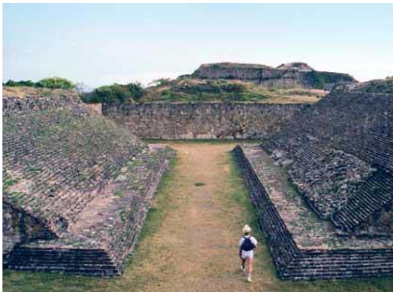
FIGURE 1. Classic Maya Ballcourt at Copan. The sloping aprons of typical classic period ballcourts make them poor candidates for complex sound effects such as whispering galleries and flutter echoes.

The great importance of the ballgame in Mesoamerica is suggested by the fact that 1,560 known Mesoamerican ballcourts were documented by the year 2000 [1]. Of these, 225 or 14.4% were found at Maya lowland sites. Ballgames at small courts were used casually, often for exercise. Ballgames were played at larger ballcourts. But the largest ballcourts were also used for religious ceremonies and rituals. Some larger ballcourts were “effigy courts”, where games were ritually enacted but not played. Some Mayanists propose that the GBC was an effigy court.