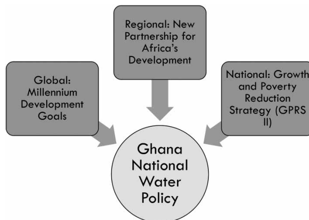
Fig. 1. The underpinnings of Ghana's National Water Policy.

The GPRS is a series of two consecutive development frameworks implemented between 2003 and 2009 with the overarching goal to reduce poverty and improve the welfare of all Ghanaians (Vordzorgbe & Caiquo, 2001; National Development Planning Commission, 2005). The first phase, referred to as GPRS I was implemented between 2003 and 2005 to ensure the attainment of macroeconomic stability while GPRS II sought to accelerate economic growth and poverty reduction between 2006 and 2009. To