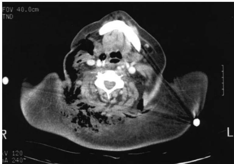
Figure 2. Soft tissue gas tracking along the cervical fascia and extending to the right carotid sheath. Gas present within the right sternocleidomastoid and trapezius muscles is characteristic of myonecrosis.

cus aureus, or peptostreptococcus) or polymicrobial (mixed aerobic and anaerobe bacteria). Risk factors for developing necrotizing fasciitis are uncontrolled diabetes, alcoholism, morbid obesity, advanced atherosclerotic disease, and decubitus ulcers.