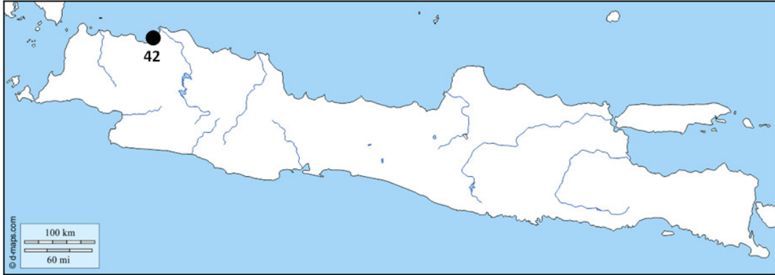
Figure 3. Map of distributional records of Urogymnus polylepis Java. There is no recent update information. Numbers refer to Table 1.