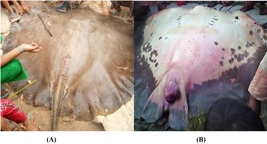
Figure 4. An Individual Stingray: (A) U. polylepis with dorsal view, Musi river, Lumpatan village, Musi Banyuasin, South Sumatra province, (B) U. polylepis with ventral view, Tanjung Pinang estuary, Batam island, Kepulauan Riau province.