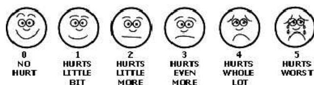
Figure 3. Wong-Baker FACES scale.

Forty-two TADs were placed in 21 patients. There was one patient out of the 21 who could not tolerate