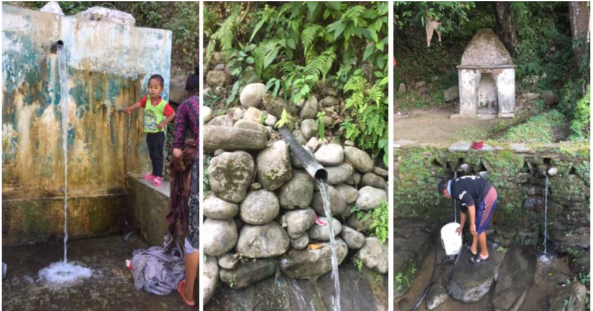
Fig. 4. Different types of sources of spring water in mid-hills regions, Nepal.

While doing so, rural roads have been constructed without consideration of the environmental impacts upon water and other natural resources. Such unplanned rural road construction leads to the destruction of existing drinking water pipe networks along the roads (Figure 5) and disturbs water spouts. In some areas, spring sources had also dried up after expansion of the rural road network.