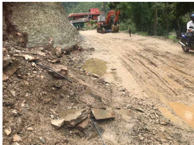
Fig. 5. Water pipe dismantled by road construction at Bahine, Pyuthan (15 June 2018).

Figure 5 shows a dismantled drinking water pipe due to expansion of the road network in Bahine, Pyuthan District. The road section lies in Bahine-6, Nau Bahini Gaun Palika. Prior to expansion of