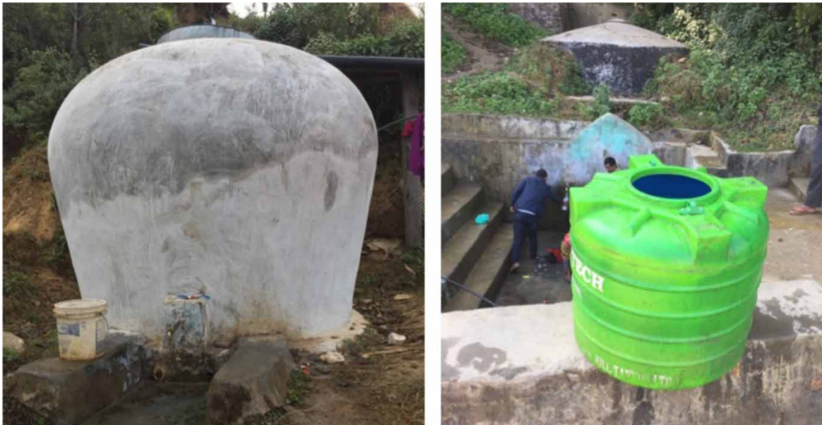
Fig. 9. Different mediums for collecting water in the mid-hills, Nepal.

Households in the mid-hills adopt different technologies to store water to use for various purposes. As depicted in Figure 9, some houses in Chamunda Bindrasaini-4, Dailekh District have adopted a rainwater harvesting technology. Using this technology, households collect rainwater from the roofs of the houses and store it in a jar. The water collected in the jar is mainly used for washing dishes, irrigating vegetables, and feeding livestock. The rainwater harvesting jar was constructed with financial assistance from non-governmental organizations. However, most of the households complain that water stored in the jar is not so suitable for long-term use as the water attracts insects. In some villages, these jars are functionless. In some areas, households collect water in polythene jars if there are transportation facilities in the locality. Water collected in polythene tanks is used for drinking, cooking, washing, and other