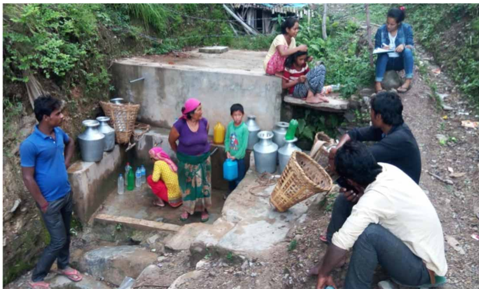
Fig. 3. Villagers in a queue while collecting water at Bhumisthan-3, Arghakhanchi District.

Arghakhanchi District. Villagers in this area rely on a spring source for fulfilling their basic water requirements. They do not have access to tap water in this area and rely entirely on the spring source that is near to the roadside. Approximately 15 households collect water and constructed a concrete tank where the excess flow of water can be stored. However, during dry periods, especially in the months of Chaitra and Baisakh (April–May), the water volume decreases in the spring and villagers have approximately 30–40 minutes to fill a 20 L bucket or jar.