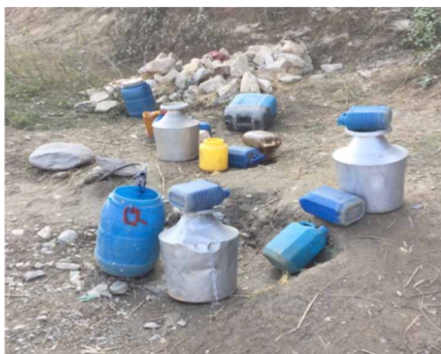
Fig. 2. Water scarcity scenario in Dullu-4, Dailekh District.

Figure 2 shows the scenario of water scarcity in Dullu-4, Dailkeh District. In this region, households rely on community tap water provided by the government. However, villagers have to wait for a long time to fill a bucket of water, and also the flow of water in the tap is irregular. Water is usually available in the morning or evening and lasts for about 2 hours, and so if villagers are busy doing other tasks they cannot fetch water. Figure 3 shows the daily routine of villagers while collecting water in Bhumisthan-3,