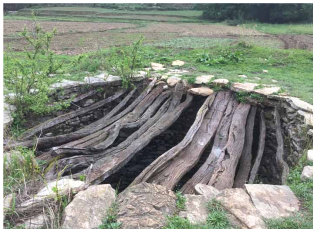
Fig. 7. Dug well that is about 30 m deep in Pag village, Dhanras-1, Chaukune Gaun Palika Surkhet District (30 June 2018).

the village seeking employment in the city center. Consequently, women and girls have to walk more than 3 hours to fill their canisters. Most of their day is spent fetching water for drinking and livestock. In the past, there were a couple of wallows in the village where livestock could drink water; however, in recent years, these ponds have also dried up and therefore villagers could not raise livestock as easily.