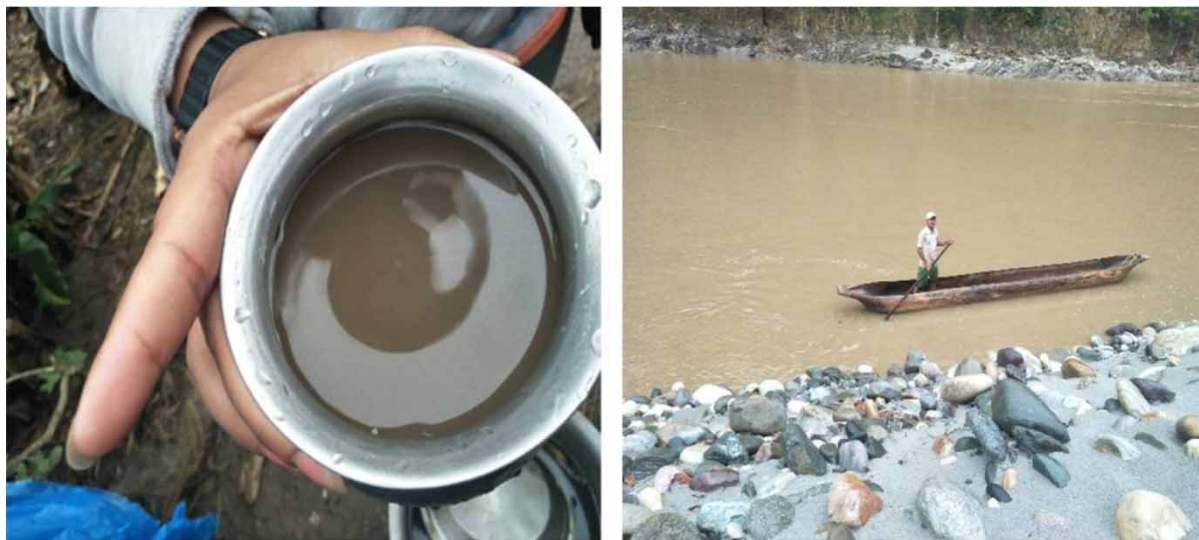
Fig. 6. Households use water from Karnali River for drinking and cooking purposes in Papighat village (30 May 2018).

have migrated either to low land areas of Kailali District or elsewhere. Currently, only 5–7 households remain in the village, and they have requested their ward office to solve the water scarcity. If they do not get any support from their ward office, the remaining households are also considering migrating to Kailali District.