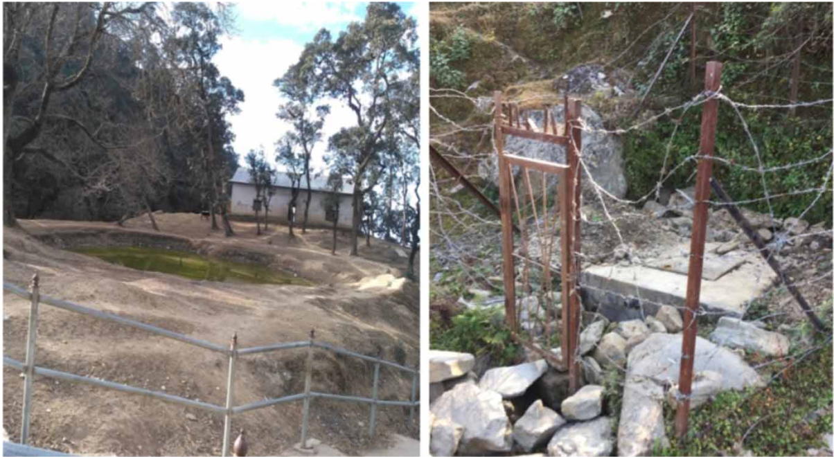
Fig. 11. Source protection methods applied in the mid-hills, Nepal.

are replaced with modern flush toilets, which consume more water. People are also conscious of their personal hygiene and wash their clothes frequently. Although no specific studies have been conducted to explore the reasons behind drying water sources, with the preliminary assessment and on-site observations we present the probable reasons behind the decreasing water supply: