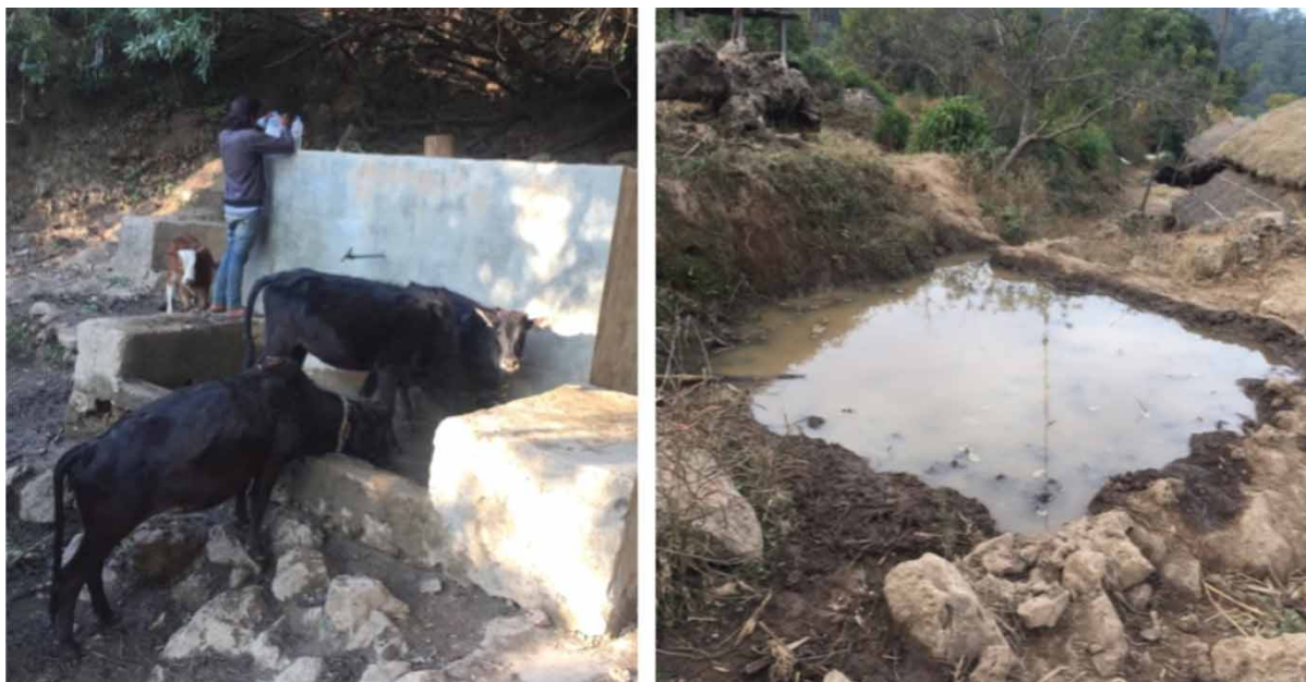
Fig. 10. Multiple use of water resources in Kelabari, Dhanras-1, Surkhet District.

Water resources are becoming increasingly scarce in Nepal's mid-hills and ultimately threaten the livelihood of rural populations. Shortage of water for agricultural production and domestic purposes during the dry months of the year is of particular concern in the mid-hills areas. Villagers believe that the amount of rainfall has decreased over the years and also the rainfall pattern is irregular, and that these are contributing to the drying up of springs in the area. Increasing population and modern lifestyles create more water requirements ( Wang et al., 2018 ). For example, these days traditional toilets