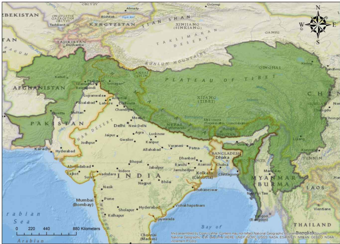
Fig. 1. Hindukush Himalayan region.