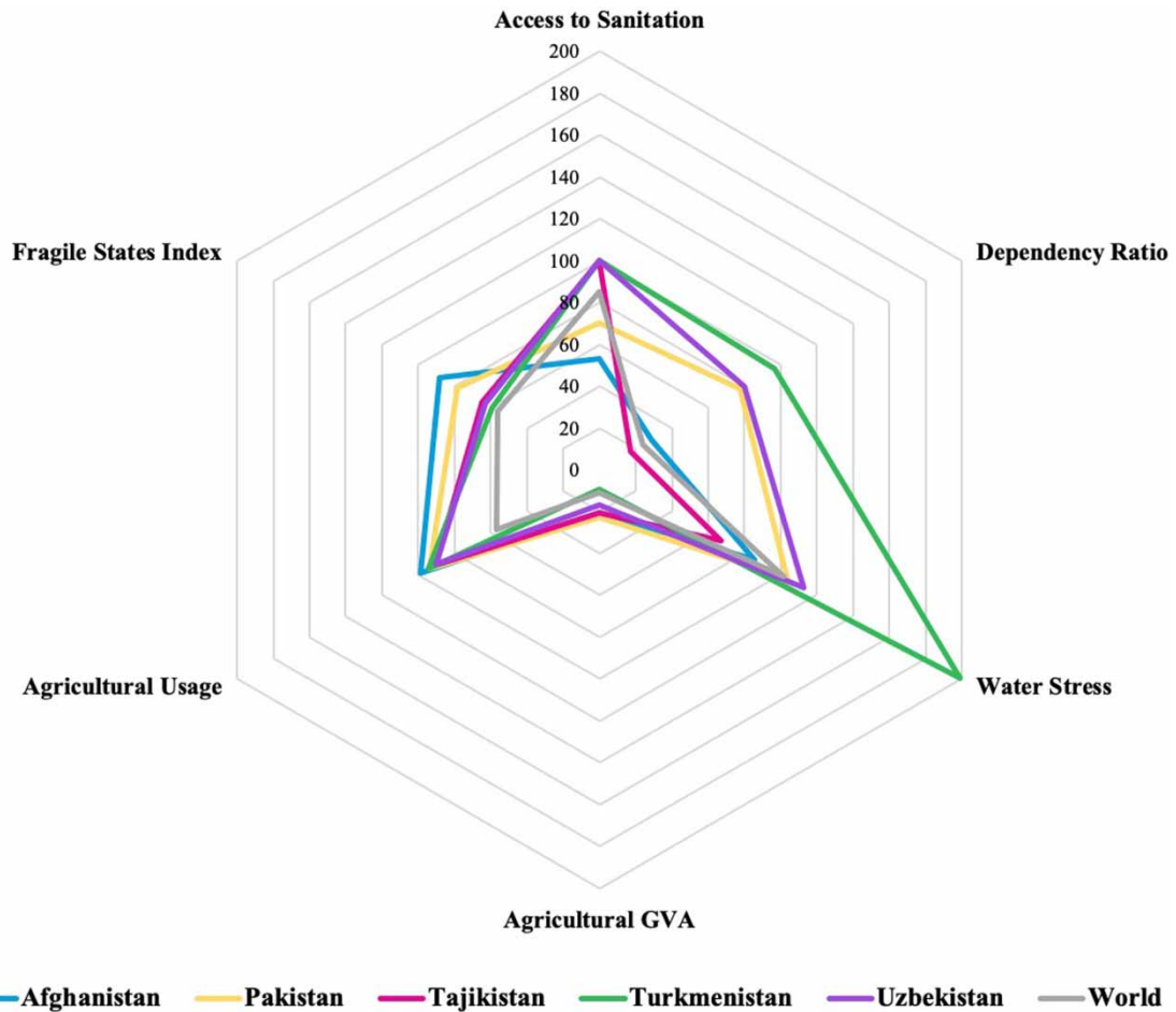
Fig. 3. Variation of key water security indicators by country: access to sanitation refers to access to an improved sanitation source, FSI stands for Fragile States Index, water stress is calculated based on SDG 6.4.1, the dependency ratio refers to the percentage of renewable freshwater originating outside the country, Ag GVA stands for the agricultural gross value added, and Ag Usage stands for agricultural water usage. All indicators are in percentage. The FSI is taken as the percentage of the observed value out of the possible total score of 120. Please refer to the online version of this paper to see this figure in color: https://doi.org/10.2166/wp.2020.235 .