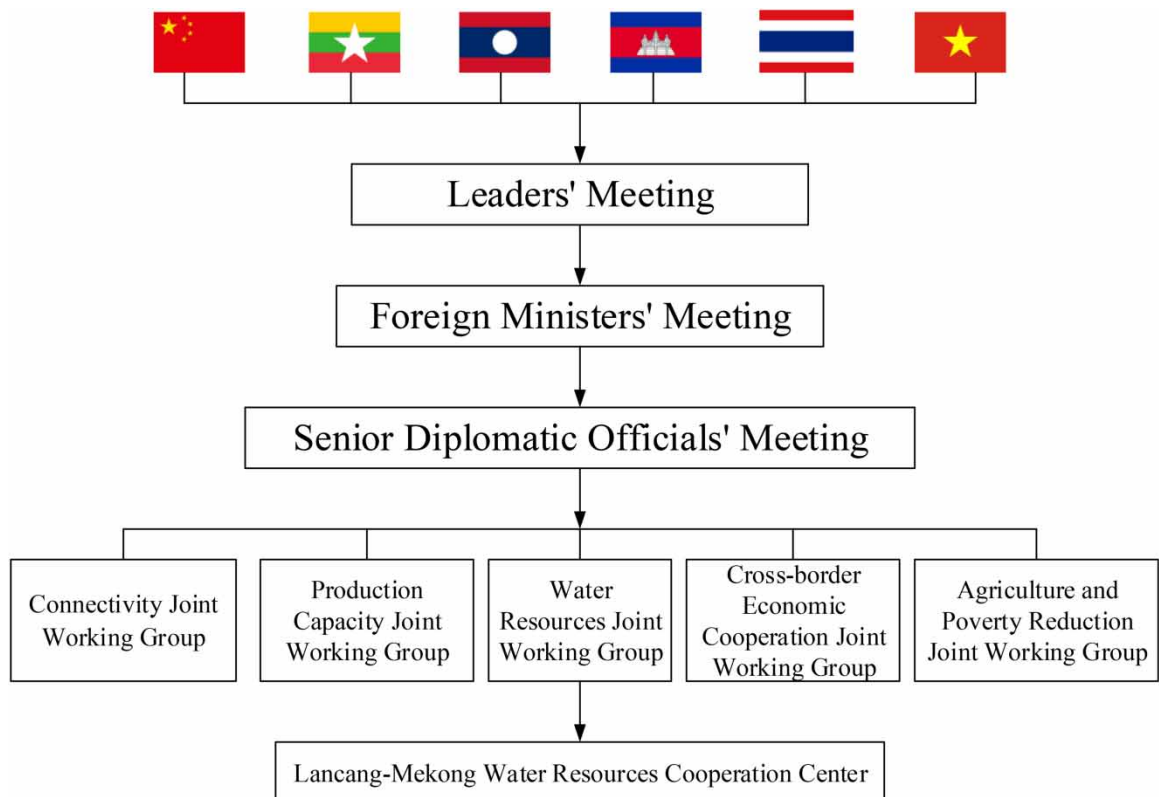
Fig. 2. Water Resources Cooperation framework under the LMC.

The LMC has become one of most dynamic and potential mechanisms in the GMS. Until now, the LMC has been developing smoothly and achieved some positive results. A series of meetings and