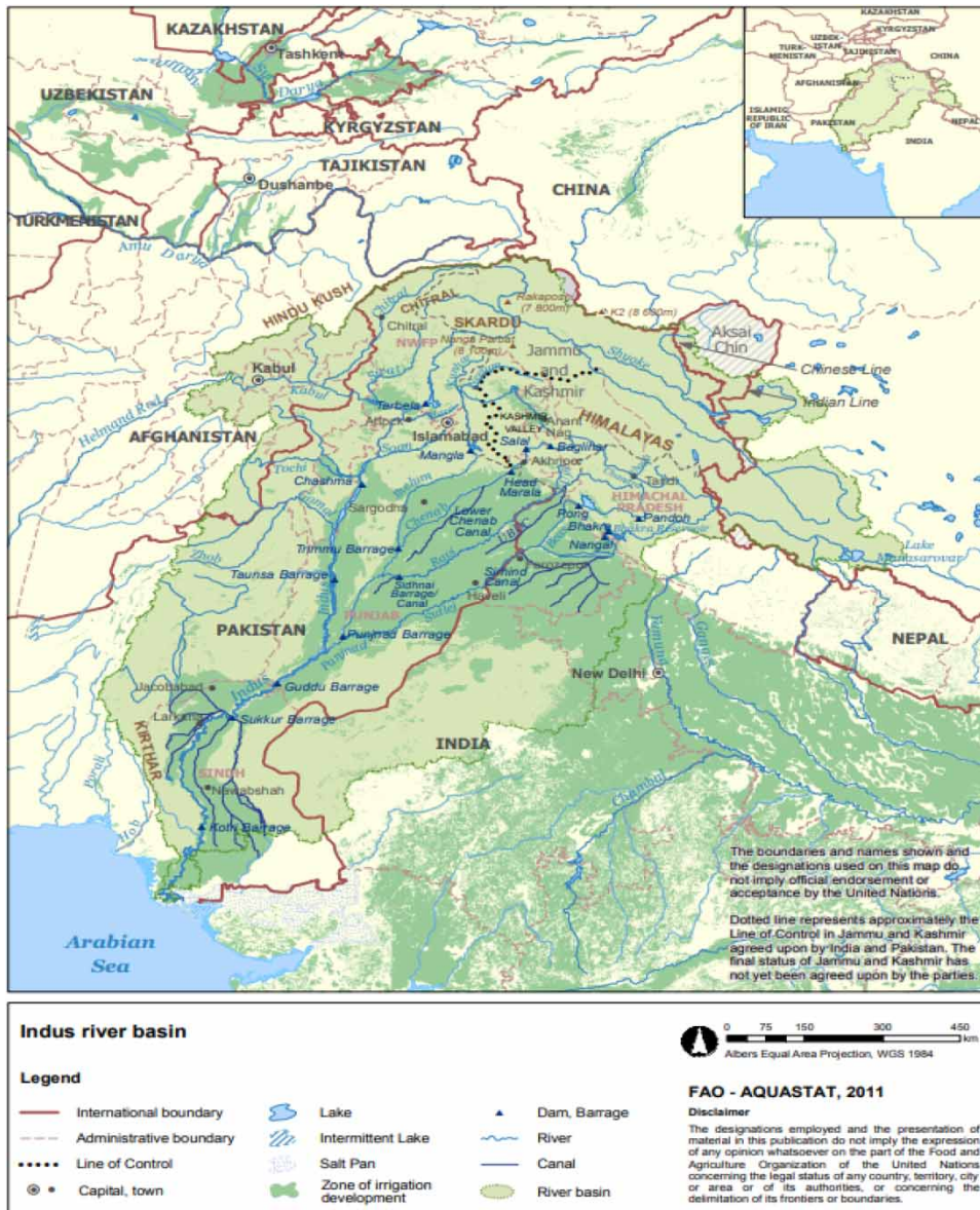
Fig. 1. | Irrigation and river network of Pakistan’s Indus Basin (FAO, 2013).