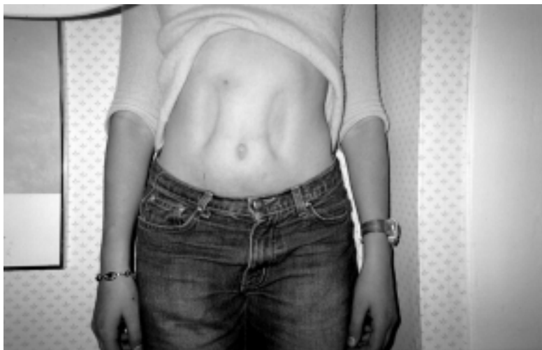
Figure 1—Two large areas of lipoatrophy in the 10-year-old patient.