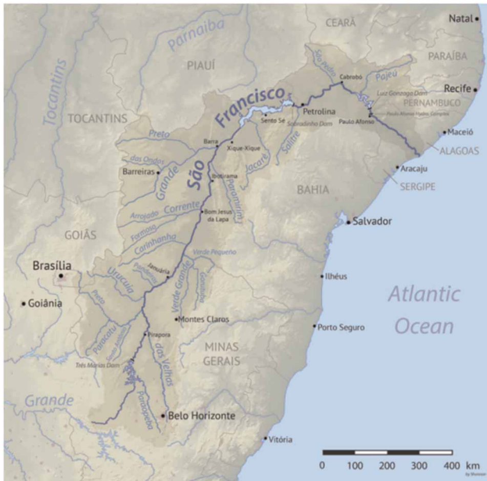
Fig. 1 | The San Francisco River.

session that lasted about 4 h, including two half-hour breaks. Participants involved in the process had different backgrounds in engineering, management, and policymaking.