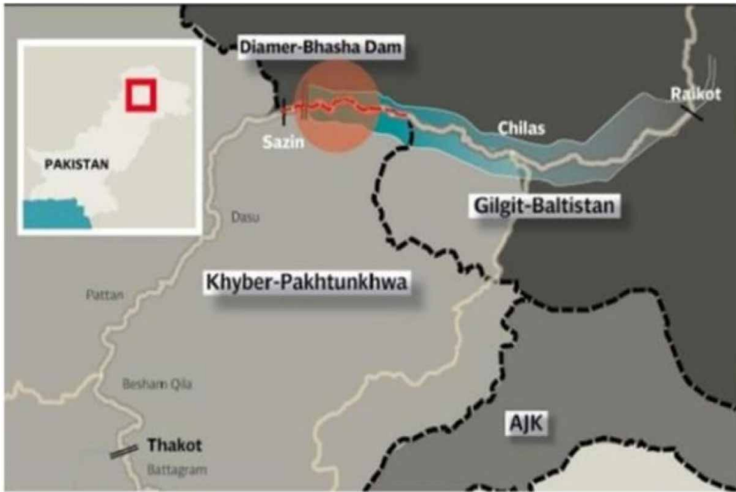
Fig. 1 | Location of the Diamer Basha Dam.

was attracting billions of rupees of donations immediately stopped receiving anything (as is depicted in Figure 2) (Editorial, 2019).