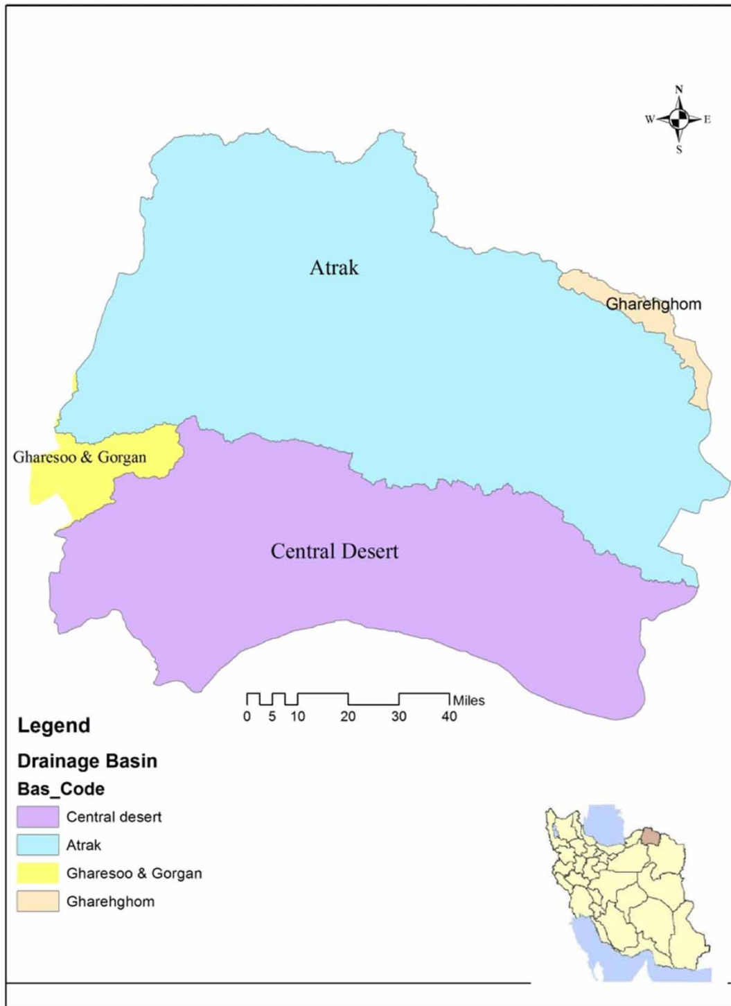
Fig. 1 | Map of drainage basins in the North Khorasan Province.