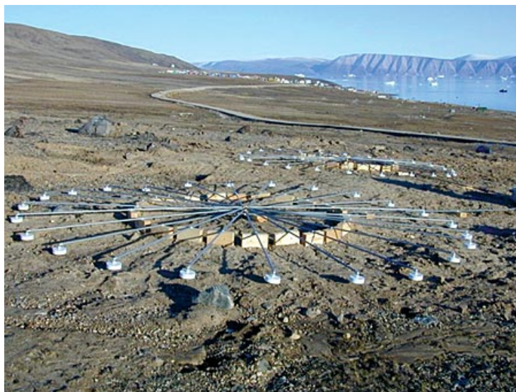
FIGURE 4. Infrasound stations such as this one in Qaanaaq, Greenland, use ultralow-frequency microphones to sample the acoustic field over areas of several square kilometers. Each microphone is surrounded by a rosette of pipes that helps filter local wind noise.

The planned 60 infrasound stations detect airborne pressure waves at frequencies below the limit of human hearing. (See the Physics Today article by Alfred Bedard and Thomas Georges, March 2000, page 32, and the Quick Study by Curt Szuberla and Ken Arnoult, April 2011, page 74.) Arrays comprising between 4 and 15 ultralow-frequency microphones, or microbarometers, are used to sample the acoustic field over an area of around 10 km 2 . Each microbarometer sits at the center of a rosette of pipes that reduces the influence of wind noise. Choosing sites with vegetation cover can further mitigate wind noise, but that isn't always an option, given that some stations are located in high deserts and Antarctica.