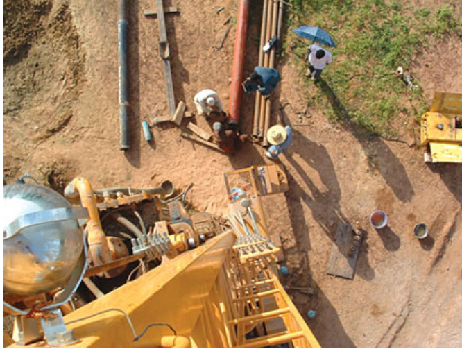
FIGURE 2. Workers install a primary seismic station in Torodi, Niger. It is one of 50 such stations that continuously transmit measurements to the Comprehensive Nuclear-Test-Ban Treaty Organization’s headquarters in Vienna.