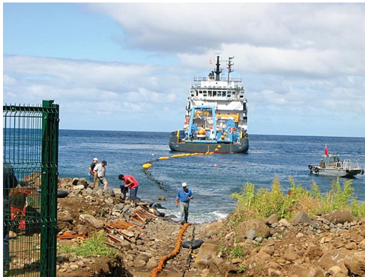
FIGURE 3. At a hydroacoustic station on an island in Chile’s Juan Fernández Archipelago, workers lay underwater cable that will connect offshore sensors with the shore-based facility.

The IMS uses two types of hydroacoustic stations: hydrophone and T-stations. At the six hydrophone stations, seabed cables run from a shore facility to an offshore location where three sensors are deployed in a horizontal, triangular configuration suspended beneath subsurface buoys. Time delays between signals registered by the sensors are used to calculate the direction of passing acoustic waves. The five T-stations, by contrast, use coastal seismometers to detect the vibrations caused by waterborne waves that hit the coast and convert to seismic waves.