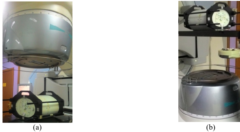
FIGURE 2. Measurements using film (a) SBRT and (b) 2D conventional radiotherapy

In addition, holder used was made from teflon material that has a density more dense than the spine. According to Gallo et al. [4], measurements in high dose irradiation cause some noisy from the flatbed scanner while scanning the films. However, according Borca et al. [6] there are no problems in dose measurements using high dose irradiation up to 40 Gy.