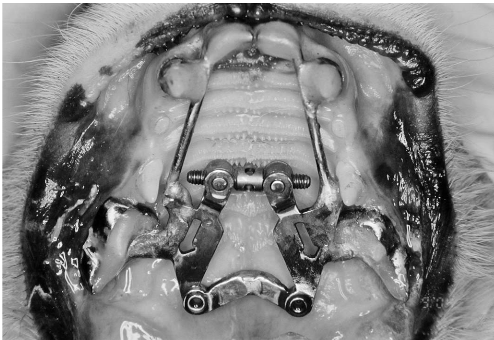
Figure 1. The double-hinged expander.