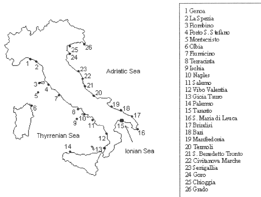
FIGURE 2. Other Italian sampling sites compared with those of Mar Piccolo.

of 0.5 mg/kg recommended by the European Economic Community (8). The levels of Pb ranged from 0.86 to 1.70 mg/kg, with an average concentration of 1.19 mg/kg. Mussel samples from location 4 (Foce Galeso) exhibited the highest level of Pb, 1.70 mg/kg. These values were lower than the maximum residual level of 2 mg/kg recommended by Italian authorities (5). The average concentrations of Cd and Cr found in mussels from the 10 locations were 0.64 and 0.31 mg/kg, respectively. Mussels collected from location 4 (Foce Galeso) had the highest concentrations of Cd and Cr, 0.70 and 0.77 mg/kg, respectively. The values of Cd did not exceed the maximum residual level of 2 mg/kg recommended by the Italian authorities (3). Concentra-