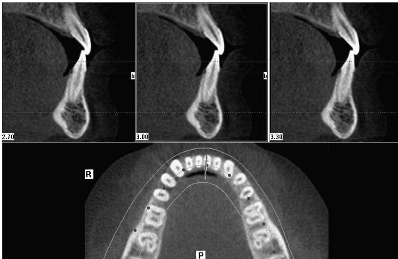
Figure 1. Dehiscence in at least three sequential views.

gingival recession, 22 identification of alveolar bone defects before orthodontic treatment is critical in treatment planning. Also, orthodontic mechanics can decentralize teeth from the alveolar bone envelope, causing bone dehiscences and fenestrations, depending on the initial morphology of alveolar bone and the amount of tooth movement. 12