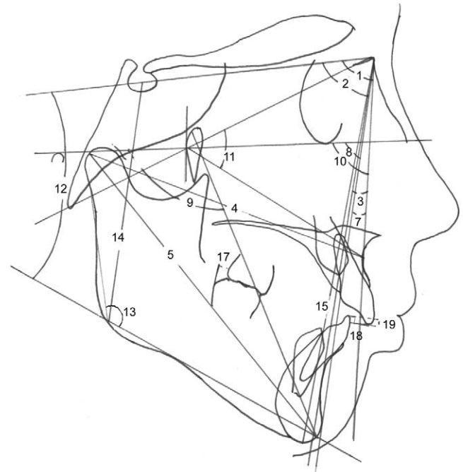
Figure 1. Angular and dimensional cephalometric measurements. 1 indicates SNA; 2, SNB; 3, ANB; 4, CoA; 5, Co-Gn; 6, maxillomandibular differential ([Co-Gn] – [Co-A]); 7, convexity (Pg-N-A); 8, facial depth (N-Pg/FH); 9, facial axis (N-Ba/CC-Gn); 10, maxillary depth (NA/FH); 11, maxillary height (N-CF/CF-A); 12, SN/GoGn; 13, GnGoAr; 14, SGo; 15, NMe; 16, S-Go/N-Me ratio; 17, molar relation; 18, overjet; and 19, overbite.

To eliminate orthopedic effects and evaluate orthodontic movement of the upper posterior teeth and lower first molar, superimpositions were made. For maxillary superimpositions, cephalometric radiographs taken at T0, T1, and T2 were superimposed on the best fit of palatal structures. The ANS-PNS plane of the pretreatment radiograph was used as the horizontal reference plane. A perpendicular to the ANS-PNS plane at point T (the most superior point of the anterior