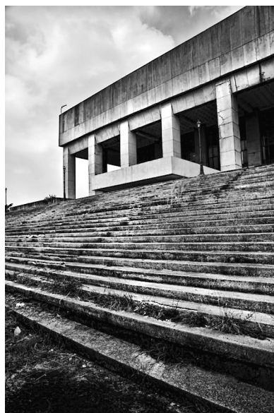
Figure 1. The Manila Film Center.

rectilinear geometry, speaks to the desire of the regime to re-present the city in a manner visible and legible to a world still captivated by Brutalist forms and the legacies of the International Style. The Film Center's reference to both antiquity and modernity also recalls the tensions that marked the dictatorship's temporal imagination—how it engendered a sense of both nostalgia and futurism by positioning itself as a force that could, at once, transport the city back to the glories of a protonational past and propel it toward advanced states of economic development. 3 Moreover, the structure's departure from and adherence to the tenets of architectural modernism mirror the precarious position occupied by the Marcos regime as a postcolonial dictatorship. Its architecture abides by central "international" principles such as the rejection of adornment and frivolity, but it also affects spectacular excess through scale, height, and the starkness of its contrast with the "thirdworldness" of metropolitan Manila. The Film Center, in other words, can be described as a structure charged with the contradictory forces that underpinned past state ambitions. It