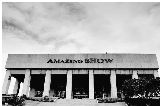
Figure 3. The Manila Film Center with the sign for the Amazing Show.

under the faint glow of the lights from the lobby. The empty space, however, still gives the impression of a place of memory. 26 Ghosts come rushing to the space of absence, which begins to appear more and more like a space in which an observer, an ethnographer or ghost hunter, might dwell in time, petrified. 27 Indeed, it is the darkest parts of the mezzanine that provoke my attention; they are the ones most open to projection and that convince me that if I come closer, if I let