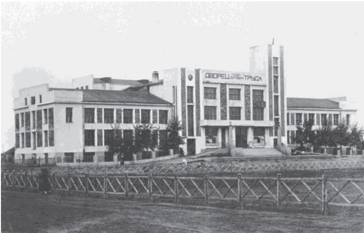
FIGURE 3. Palace of Labor in Kemerovo. Photo of 1930s [11, sh. 65, photo 2]