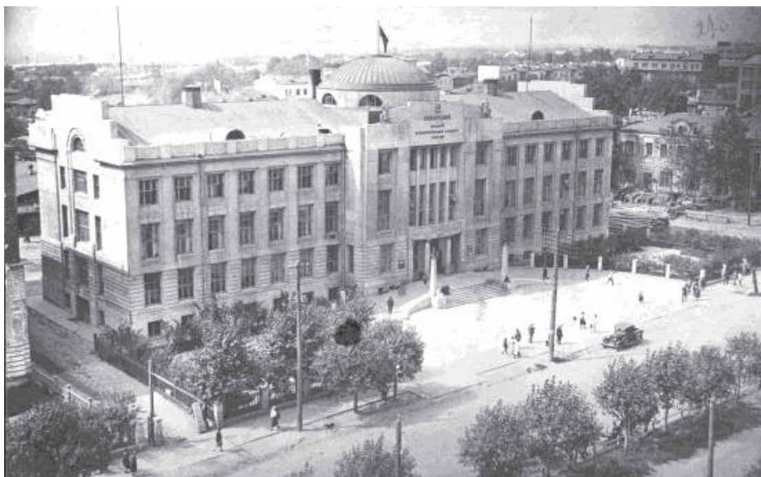
FIGURE 1. Sibrevkom building in Novosibirsk, Photo of 1930s [19, sh. 1]