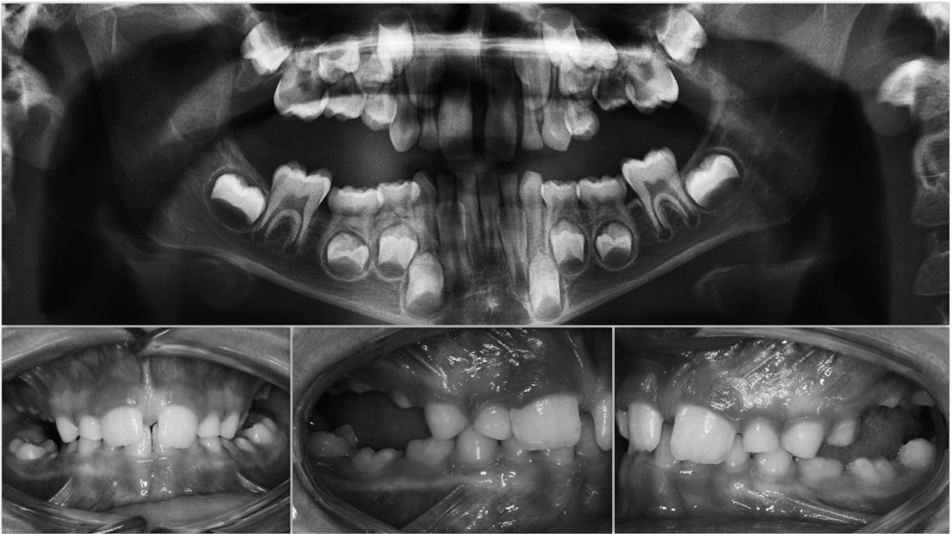
Figure 2. Intraoral photos. Panoramic: synonymous variant in exon 10 (position 3:46899419) c.1152 G>A.

since the two amino acids have the same charge, the mutation is not considered highly pathogenic.