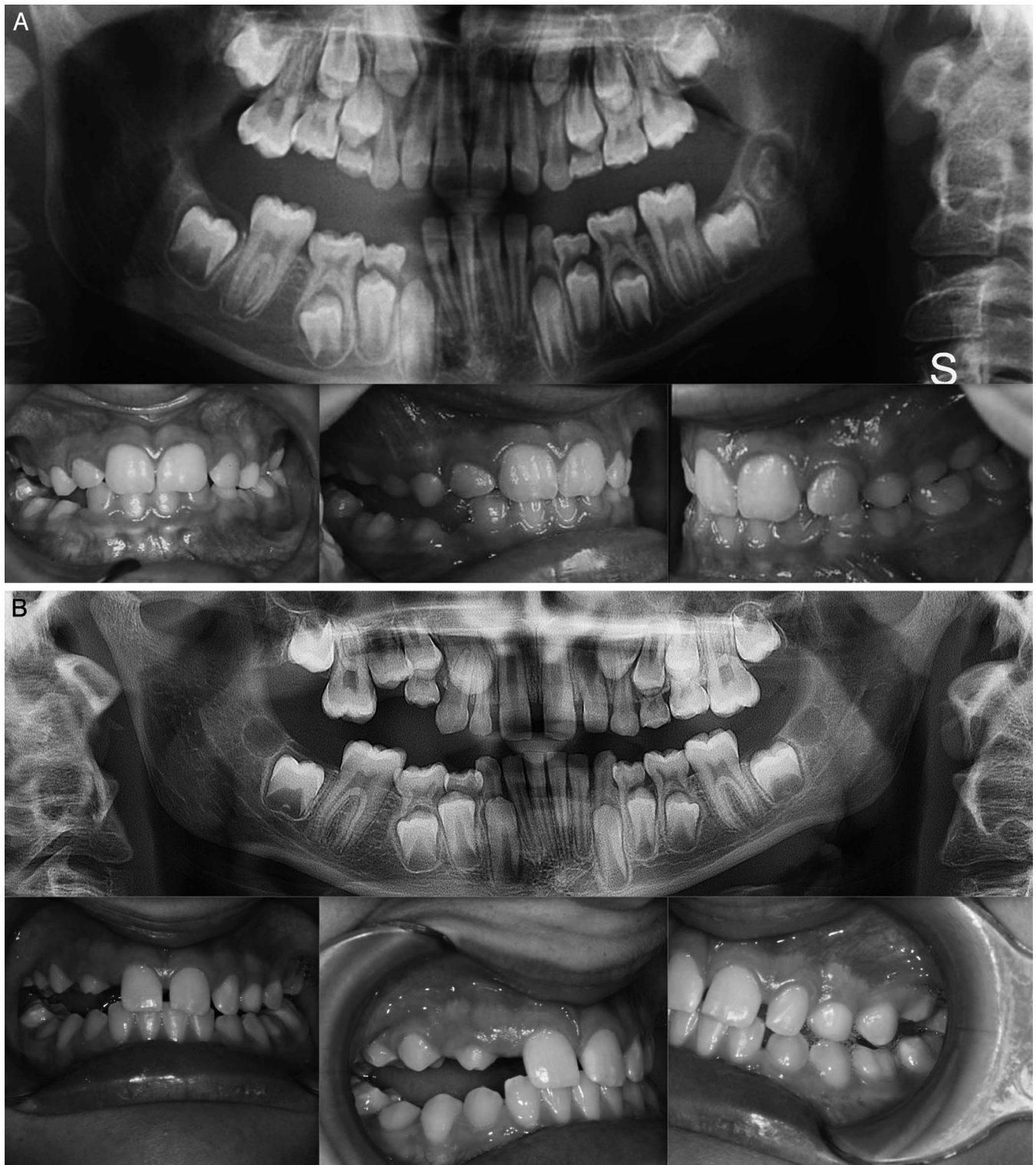
Figure 1. (A, B) Intraoral photos of two brothers. Panoramic: variant downstream of exon 5 (CTCF Binding site) rs113566258 SNP c.313+32 A>G; variant in exon 16 (position 3:46903467) c.1593-95 Del C, p.531/532; synonymous variant in exon 10 (position 3:46899419) c.1152 G>A.

c.1152G>A, was found in an isolated case, featuring a severe open bite due to PFE (Figure 2).