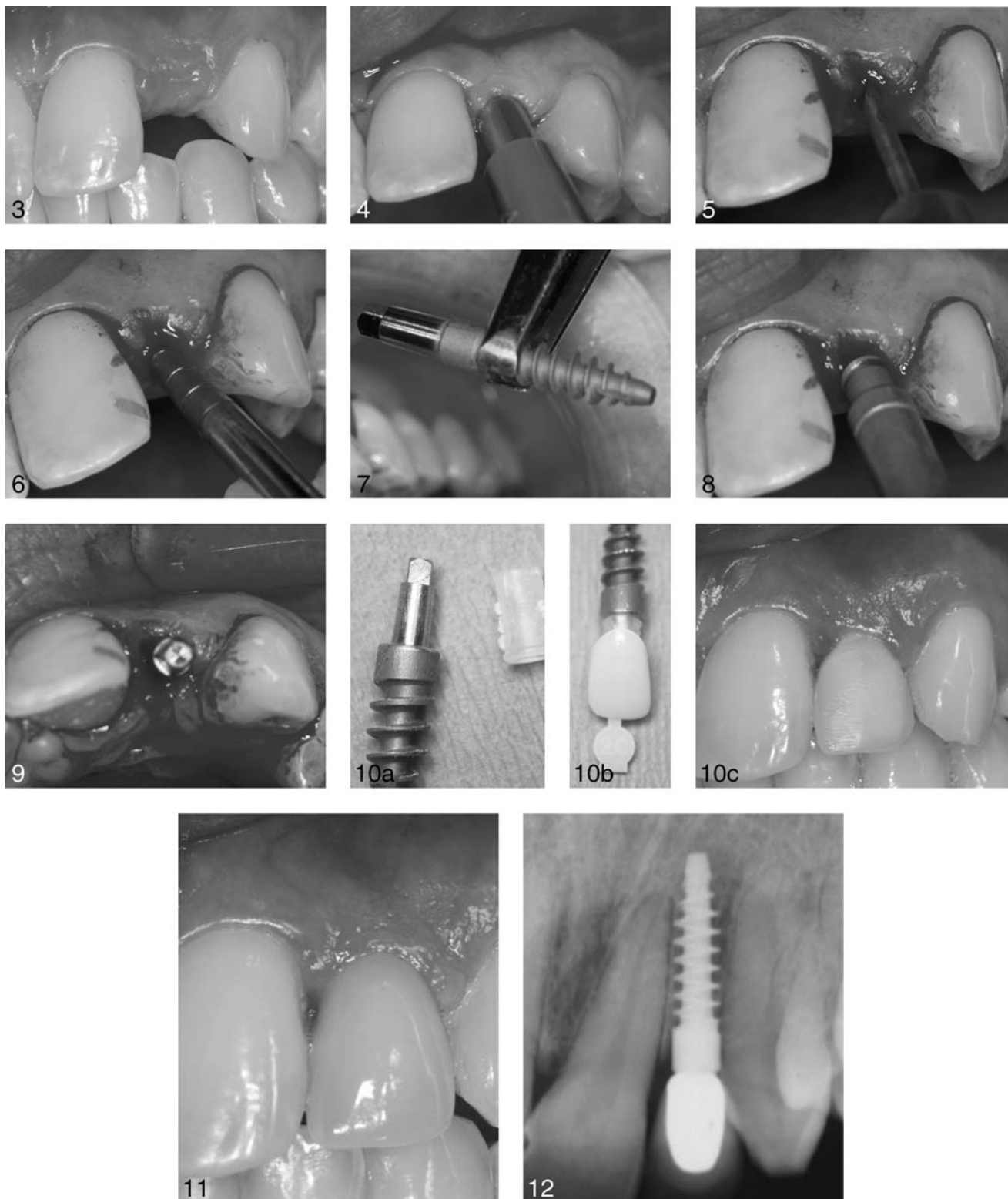
FIGURES 3–12. FIGURE 3. The operative site of tooth #10 indicates a good zone of fixed, keratinized gingiva and adequate dimensions to permit the placement of an implant. FIGURE 4. A 4-mm, disposable, soft-tissue biopsy punch is used in the center of the healed operative site. Turning and pressing its handle will incise a circular piece of tissue, permitting its simple removal. Of note is the well-preserved papilla. FIGURE 5. The 2-mm diameter pilot drill is used after a cortical entry made by a high-speed #557 bur. It is directed to depth 1 mm beyond the full depth of the planned implant and in a direction that will permit a proper angle of