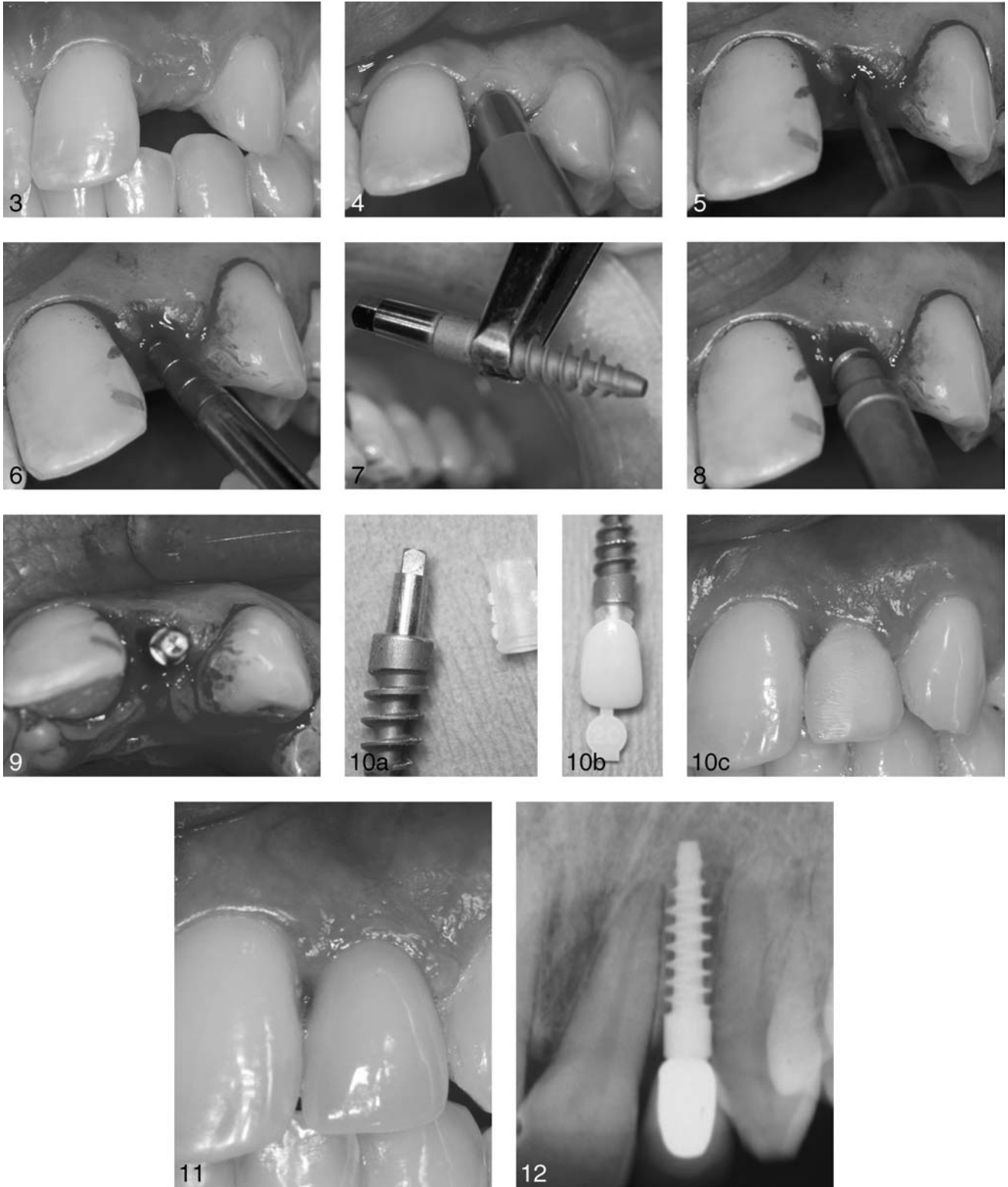
FIGURES 3–12. FIGURE 3. The operative site of tooth #10 indicates a good zone of fixed, keratinized gingiva and adequate dimensions to permit the placement of an implant. FIGURE 4. A 4-mm, disposable, soft-tissue biopsy punch is used in the center of the healed operative site. Turning and pressing its handle will incise a circular piece of tissue, permitting its simple removal. Of note is the well-preserved papilla. FIGURE 5. The 2-mm diameter pilot drill is used after a cortical entry made by a high-speed #557 bur. It is directed to depth 1 mm beyond the full depth of the planned implant and in a direction that will permit a proper angle of