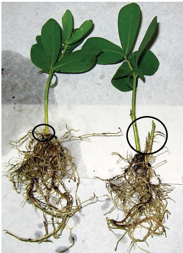
Fig. 1. Baptisia australis cuttings crowning (formation of bud at the root-shoot union) 56 days after cuttings were struck. Crowns forming above the uppermost roots are circled for emphasis.

Many native species are currently propagated by ornamental nurseries from wild-collected seed. This practice reduces population numbers and can decrease genetic diversity of