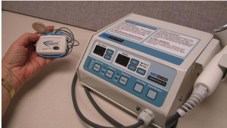
Figure 1. Wearable ultrasound device compared with commercially available therapeutic ultrasound system.

In comparison to the Rich-Mar clinical therapeutic ultrasound system shown in Figure 1, the LITUS device is less than 1/20 th of the size, does not require wall power, and may provide the same treatment as is customary in current physical therapy. However, in this study the device was calibrated at 0.65 Watts and a nominal 90 mW/cm 2 to deliver ultrasound for 5.5 hrs continuously per charge.