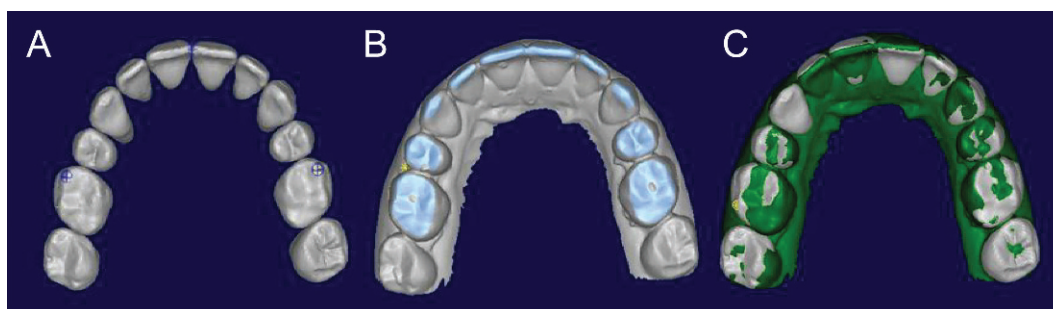
Figure 1. Arch registration for model superimposition. (A) Selection of points for initial three-point match registration on mesial-buccal cusps of first molars and incisal contact point between central incisors. (B) Selection of fit regions containing occlusal surfaces of first molars and premolars, tips of canines, and incisal edges of lateral and central incisors. (C) Best-fit registration of posttreatment digital model (green) on virtual treatment plan model (white).

The posttreatment digital models of each individual arch were globally superimposed on the virtual treatment plan models utilizing best-fit surface-based registration (Figure 1). Initial registration was completed by three-point match based on the mesial-buccal cusps of first molars and the incisal contact point between central incisors. The initial registration was then refined using an iterative closest-point algorithm to align the posttreatment digital model and virtual treatment plan model according to the best fit for each individual arch. Alignment was based on a predefined fit region, which consisted of the occlusal surfaces of the first molars and premolars, tips of canines, and incisal edges of lateral and central incisors. This region was chosen to represent the average occlusal plane for each arch. Alignment of the posttreatment digital model to the virtual treatment plan model was completed by 30 transformations of the iterative closest-point algorithm.