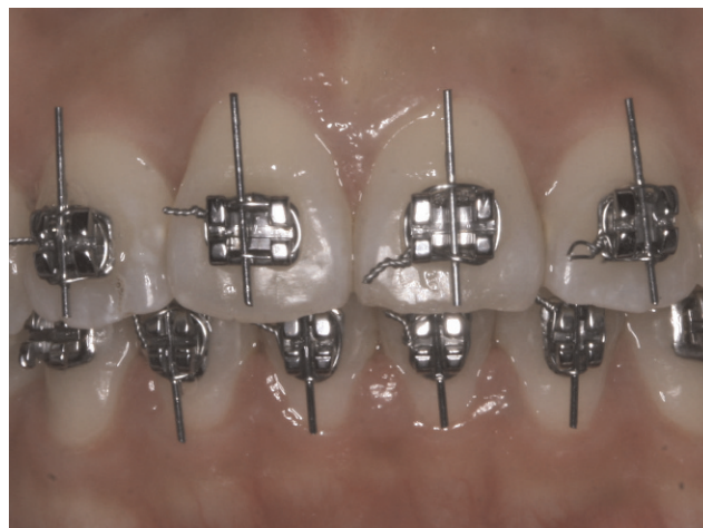
Figure 2. Panoramic radiograph on which the length of teeth and rods was measured.

Method error for root resorption was determined by randomly selecting 10 radiographs and measuring them again 1 month after the original measurements