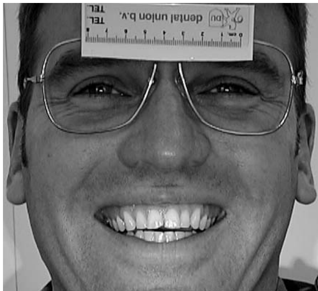
Figure 2. Spontaneous photograph of the participant smiling made using the digital videographic method.

the maxilla. Using a within-person mean score to express the smile line would result in an incorrect view, as the heights of the smile line between the teeth of a person can differ considerably.