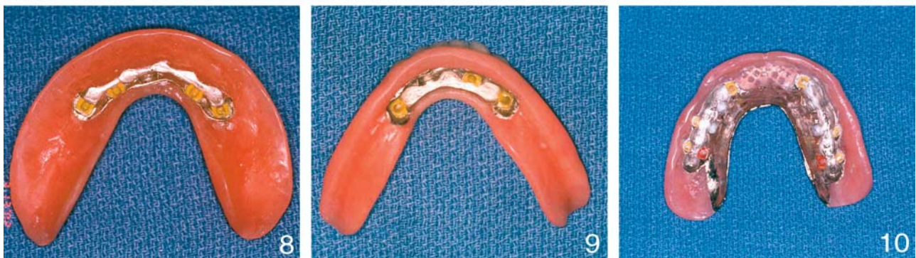
FIGURES 7–10. FIGURE 7. Bredent color-coded retentive clips. FIGURE 8. Mandibular overdenture with secondary bar and lingual and distal clips. FIGURE 9. Mandibular overdenture with secondary bar and buccal and distal clips. FIGURE 10. Maxillary overdenture with secondary bar and buccal and palatal clips.

model and the females (yellow) are snapped onto the attachments parallel to each other (Figure 5). All undercuts in the case are blocked out, including under the attachments. A silicone mold is formed for duplication and a refractory model is poured in investment material. The over-casting is waxed onto the refractory model and is then cast and depleted. The attachment housings (Figure 6) are automatically created as part of the overframe, which is the metal casting encapsulator.