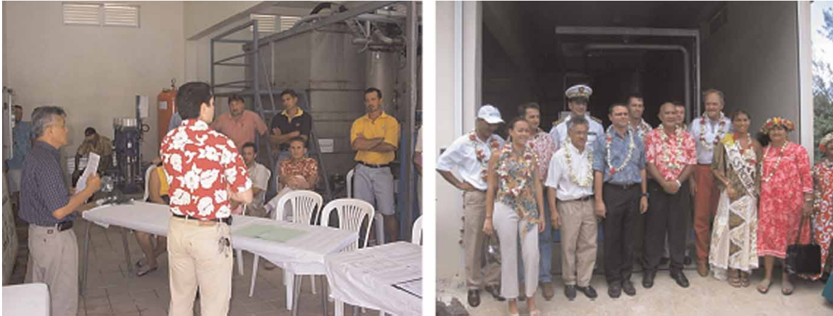
Figure 2 | Public forums organized at the water recycling plant.