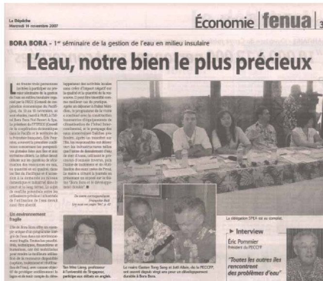
Figure 1 | View of a workshop with a media release.