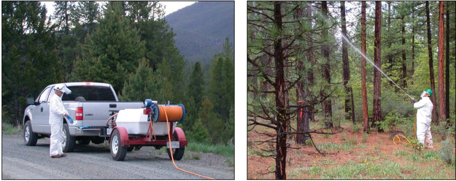
Fig. 1. Bole sprays are commonly used to protect conifers from bark beetles in the western United States.