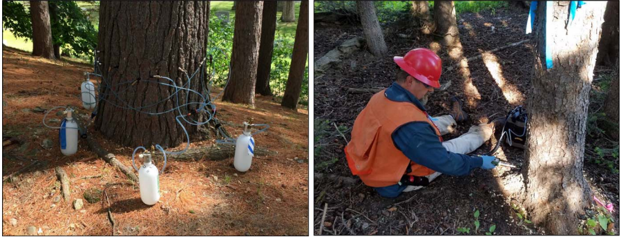
Fig. 2. Recent advances in tree injection offer a viable alternative to bole sprays: Tree IV micro infusion ® (left) and QUIK-jet AIR ® (right) (Arborjet Inc., Woburn, MA). Following injection, the product is transported throughout the tree to the phloem, where bark beetles feed. Injections can be applied at any time of year when trees are actively translocating materials, but time is needed to allow full distribution of the active ingredient within the tree before the tree is attacked by bark beetles.

Southern pine beetle. To our knowledge, no studies have been conducted on the effects of pyrethroids on D. frontalis in the western United States. Limited research conducted in the southeastern United States suggests that 0.5% permethrin (Astro) has longer residual activity than 0.06% bifenthrin (Onyx) (Strom and Roton 2009) (Table 3). In that study, small P. taeda (~9 cm dbh) were sprayed to a height of ~2.5 m and left standing in the field until they were cut for inclusion in a small-bolt assay.