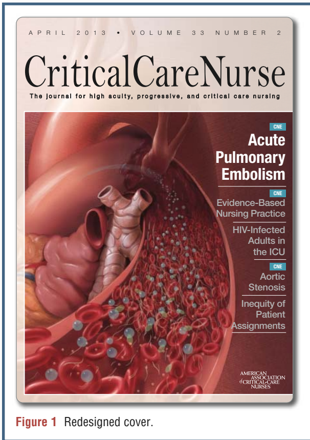
Figure 1 Redesigned cover.

completed each year, few directly relate to critical care, acute care, or progressive care patient populations. We are indeed fortunate, then, that one of the entities within the Cochrane Collaboration is the Cochrane Nursing Care Field (CNCF, http://cncf.cochrane.org ). CNCF members prepare summaries of nursing care–relevant Cochrane Reviews for publication in nursing journals to heighten awareness of Cochrane Reviews among nurses and to facilitate the transfer of the valid and reliable research findings into practice. Final preparations should be completed in this endeavor very soon, so we look forward to sharing more details with you as soon as these are determined.