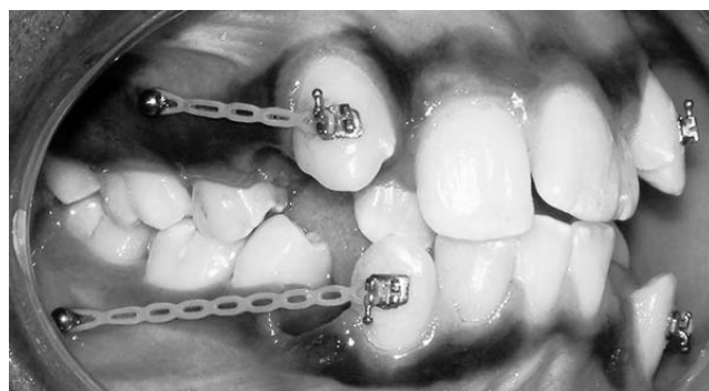
Figure 5. Immediately loaded large grit acid-etched implants.

Anatomical location (posterior maxilla vs posterior mandible), the design (machined titanium vs sand-blasted, acid-etched) and dimensions of each implant, the character of soft tissue at the screw head emergence (keratinized vs oral mucosa), and magnitude of applied orthodontic forces were recorded for each patient. In addition, the torque range at the time of insertion was recorded. A perception of surgical challenge for each type of mini-implant was recorded by the periodontist on a three-point scale (simple, moderate, and difficult). Postsurgical pain encountered for the first few days was recorded by each patient; using a four-point scale (no pain, mild, moderate, severe). During the course of orthodontic treatment, the implant sites were examined at every visit for signs of infection or others complications.