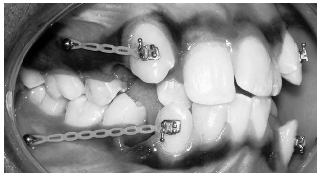
Figure 5. Immediately loaded large grit acid-etched implants.

Anatomical location (posterior maxilla vs posterior mandible), the design (machined titanium vs sand-blasted, acid-etched) and dimensions of each implant, the character of soft tissue at the screw head emergence (keratinized vs oral mucosa), and magnitude of applied orthodontic forces were recorded for each patient. In addition, the torque range at the time of insertion was recorded. A perception of surgical challenge for each type of mini-implant was recorded by the periodontist on a three-point scale (simple, moderate, and difficult). Postsurgical pain encountered for the first few days was recorded by each patient; using a four-point scale (no pain, mild, moderate, severe). During the course of orthodontic treatment, the implant sites were examined at every visit for signs of infection or others complications.