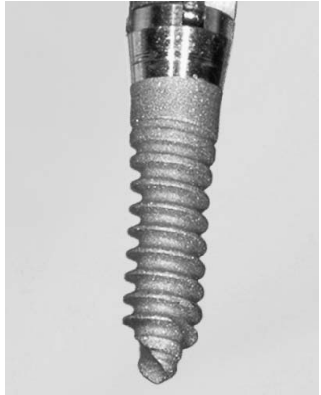
Figure 2. Sandblasted, large grit, acid-etched.

Ten healthy patients, ages 13 to 65 years, whose treatment plan included the use of temporary anchorage devices (TADs), were included in the study. Clin-