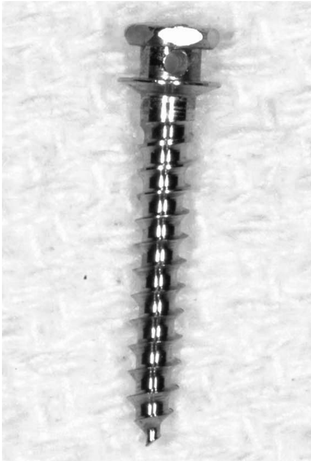
Figure 1. Machined titanium.

characteristics under immediately applied continuous orthodontic loading.