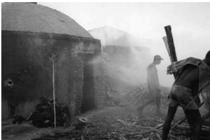
Figure 1. Charcoal kiln being loaded showing wood smoke emissions by neighboring kilns.

Urinary Mutagenicity. Urinary mutagenicity was assessed with the Salmonella plate-incorporation mutagenicity assay (25). Preliminary experiments were done with pooled urine samples from exposed workers to identify the most sensitive strain of Salmonella . The strains tested were the frameshift strains TA98 ( hisD3052 , rfa , \Delta uvrB , pKM101) and its homologue YG1041, which contains acetyltransferase and nitroreductase activities (26), as well as the base-substitution strain TA100 ( hisG46 , rfa , \Delta uvrB , pKM101) and its homologue YG1042. These preliminary experiments were done without and with Aroclor 1254-induced Sprague-Dawley rat liver S9 (Moltox, Boone, NC) mix at 1 mg of S9 protein/plate. Doses of urine extract