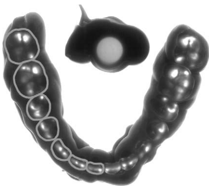
Figure 1. Scanned image of the occlusal registration (mandibular surface facing downward) in one orthodontic patient. On the left side is an example of manual insulation of each single tooth.

ing a diabase control plane with comparator. The mean error was \pm 20 \mu\text{m} . The calibration step wedges were scanned and analyzed with Image Pro Plus software (Media Cybernetics Inc, Silver Spring, Md). A gray-scale value according to the pixel density was obtained (ie, the thickness of the sample). Using a physical theoretical approach to the phenomenon of light absorbance through a material, we defined an equation that fit with our data as