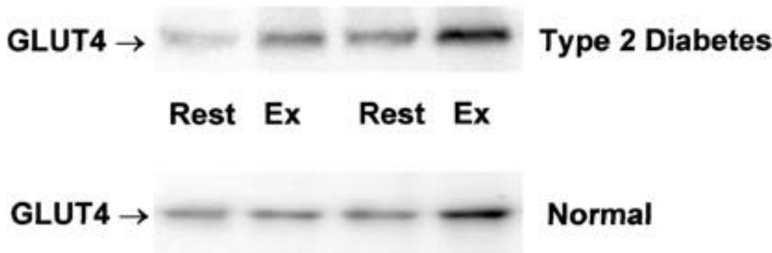
FIG. 1. GLUT4 protein content in plasma membranes isolated from skeletal muscle of subjects with type 2 diabetes and normal control subjects. The image shows immunoreactive GLUT4 from two subjects with type 2 diabetes and two normal control subjects studied in the resting state and after an acute bout of cycle exercise (Ex). Plasma membranes were fractionated and immunoblotted for GLUT4 protein as described in METHODS.

We chose a physiologic exercise stimulus of 60–70% of the subjects VO_{2max} for a duration of 45–60 min to determine whether moderate-intensity cycle ergometry exercise can induce a significant translocation of GLUT4 to the plasma membrane of normal control subjects or those with type 2 diabetes. A positive correlation between the total work per-