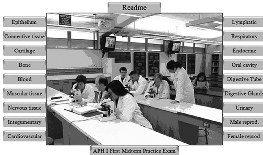
Figure 1. User interface page of the interactive atlas of histology.