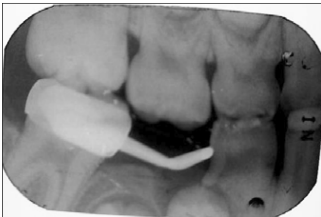
Figure 2: Right bite-wing radiograph after 16 months, demonstrating distal root resorption of the mandibular primary first molar.