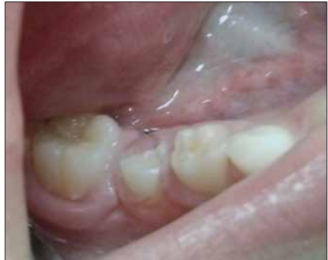
Figure 3: Clinical appearance immediately after removal of the space maintainer.