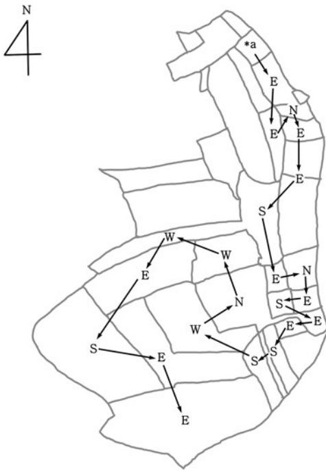
Figure 3. Directional information in the Kwangmu land registers and actual locations (*a=starting point).

During the initial examination, I fixed a north-south axis as a vertical line, following the convention of cadastral maps in the colonial period. I checked the accuracy of direction information in the Kwangmu land registers and discovered, as mentioned earlier, that for about 20 percent of the cases the information was unhelpful in determining the location of parcels. A section depicted in figure 3 is an example of this situation. Directions recorded in the registers do not accord with the vertical north-south axis. Downward trajectories in the map were represented as “toward the east” rather than “toward the south.” Such instances where direction records do not correspond to the directional axes comprise the ambiguous 20 percent of cases.