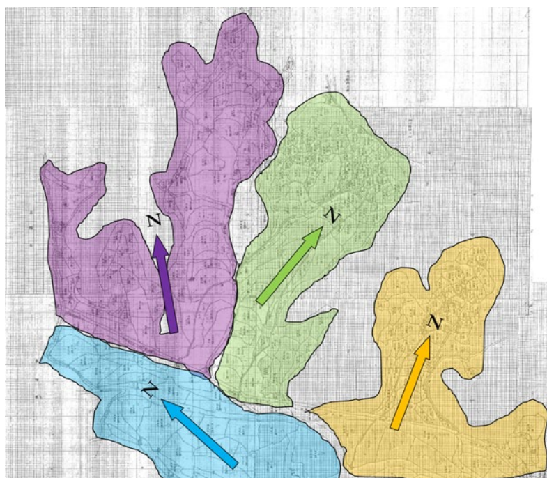
Figure 4. Several blocks in village B. Each block shares the same direction of north-south axis.

distinct north-south axes identified by the surveyors who walked through them. Figure 4 is an example of this phenomenon in village B. The map is the north-western corner of village B. I drew four additional color-coded sections to mark land registers with a shared definition of north as identified by the arrows of the same color. Although there is no explicit borderline between each of the colored sections, natural terrain features, such as streams, bogs, and hills, act as natural boundaries between each section. Judging directions from an egocentric frame of reference allows the north-south axis to be rearranged.