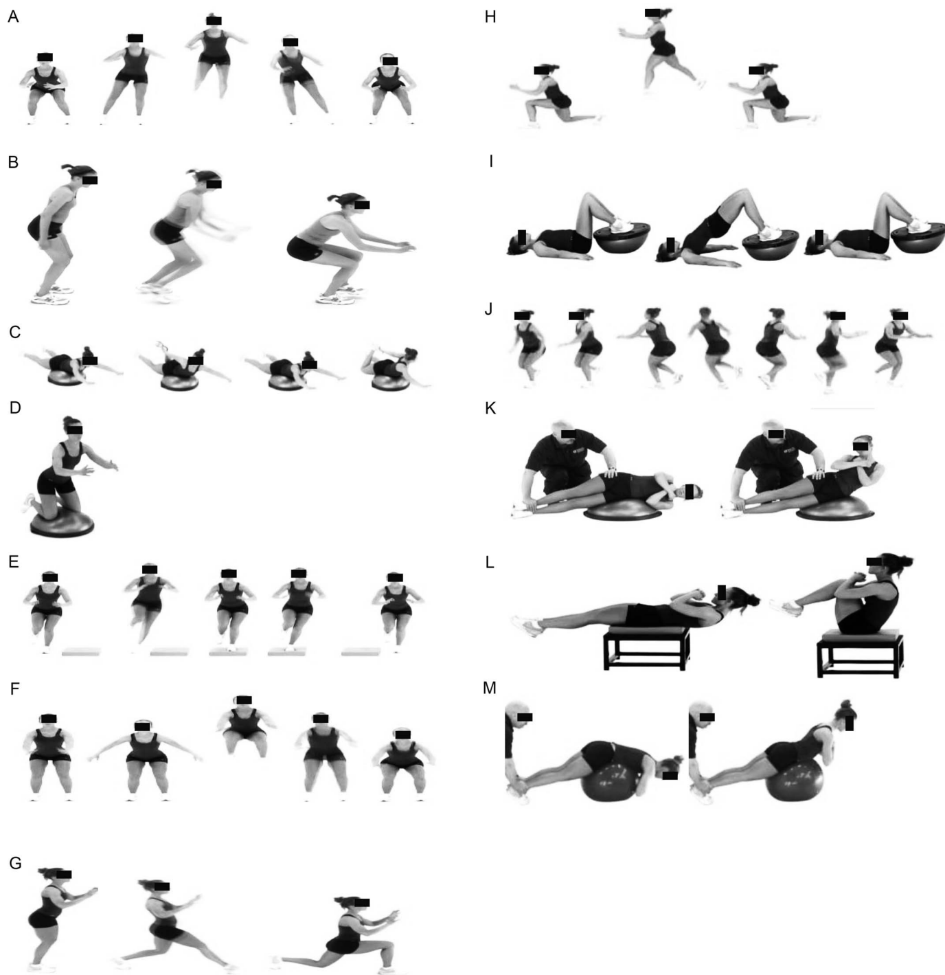
Figure 1. Examples of neuromuscular-training intervention exercises completed preseason. A, Lateral jump and hold; B, step hold; C, BOSU (round; Ashland, OH) swimmers; D, BOSU (round) double-knee hold; E, single-legged lateral AIREX (Airex AG, Sins, Switzerland) hop-hold; F, single tuck jump with soft landing; G, front lunges; H, lunge jumps; I, BOSU (flat) double-legged pelvic bridges; J, single-legged 90° hop hold; K, BOSU (round) lateral crunch; L, box double crunch; M, Swiss ball back hyperextensions.

for 10 to 15 minutes, 2 times per week, until the end of the competitive season.