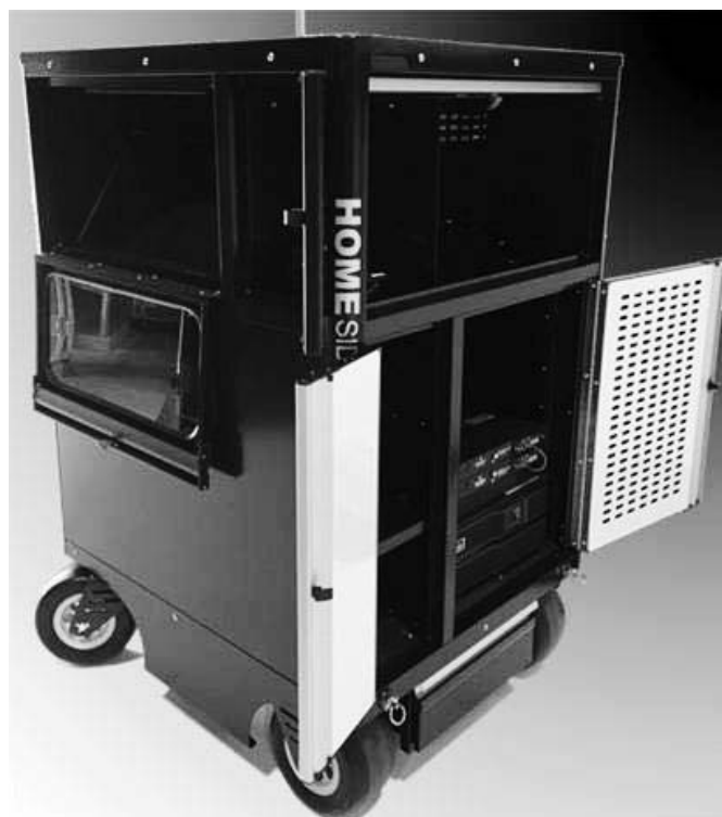
Figure 2. Sideline video monitor and cart enclosure.

The ATC spotter must speak directly to the team physician, UNC, or head athletic trainer when reviewing a potential injury. The staff member assigned to answer the