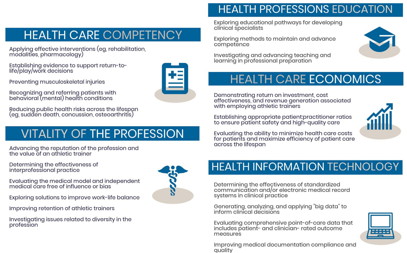
Figure 2. Athletic Training Research Agenda.

The purpose of the athletic training research agenda is to identify research priorities and unify research with clinical practice to improve patient care and advance the profession. The inter-association task force used a mixed-methods research approach. Through focus groups, content analysis expert review, and the survey of athletic trainers, the research priorities were identified.