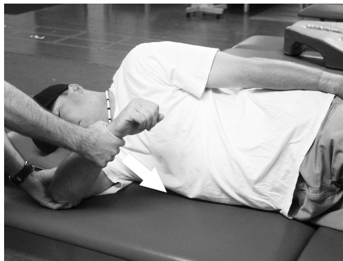
Figure 3. Sleeper stretch performed in side-lying position with passive internal rotation.

examiner passively internally rotated the humerus, and, with the other hand, he stabilized the scapula by applying pressure to the anterior acromion 22 until termination of humeral rotation (Figure 1). At this position, the digital inclinometer was aligned with the ulna (using the olecranon process and the ulnar styloid for reference), 23 providing an angle between the forearm and a perpendicular plane to the examination table. Next, this process was repeated for external rotation measurements.