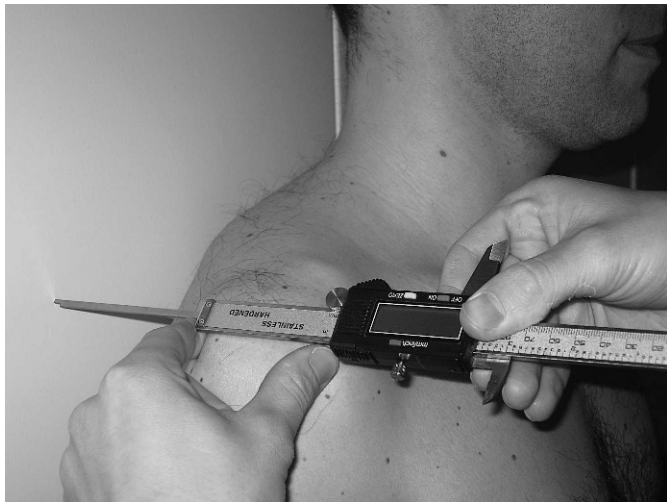
Figure 4. Measurement of the distance between the acromion and the wall.

T3 or T4; and the inferior angle should be level with T7, T8, T9, or even T10. 6 A forward-tilting and downward-rotated scapula can be observed by forward and downward dropping of the acromion. 6 Scapular positioning was deemed impaired when deviations from the ideal resting position occurred: (1) the inferior angle of the scapula became prominent dorsally, rotating about the horizontal axis (tilting); (2) the entire medial border of the scapula became prominent dorsally, rotating about the vertical axis (winging); (3) the medial border of the scapula showed excessive translation around the chest wall (protraction); (4) the scapula showed excessive elevation or depression (elevation or depression); or (5) the medial border of the scapula was positioned parallel to the spine only at rest with both arms relaxed (rotation) (Figure 1). If one of these criteria was satisfied, we judged scapular positioning to be impaired.