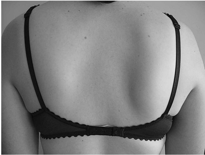
Figure 1. Observation of the scapula in resting position with both arms relaxed shows winging of the right scapula.

barefoot. Both assessors independently evaluated both shoulders. First, assessor 1 evaluated both shoulders and exited the room. Second, assessor 2 entered the room and performed the same measurements. Each assessor was blinded to the other's outcomes but was not blinded to the side-to-side differences. Palpation was used to find the bony landmarks. Lewis et al 32 reported that palpation is a valid method to identify the position of the scapula. To reduce the altering effect of natural light on the body, only overhead artificial lighting was used.