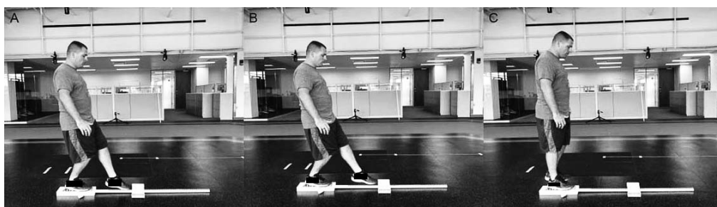
Figure 2. Single-legged anterior-reach test.

Descriptive statistics were calculated for each measure. Paired-samples t tests were used to compare functional performance between the dominant and nondominant limbs. Cohen d z effect sizes were calculated for differences in ankle-DF ROM, SLAR, and SLHOP test performance