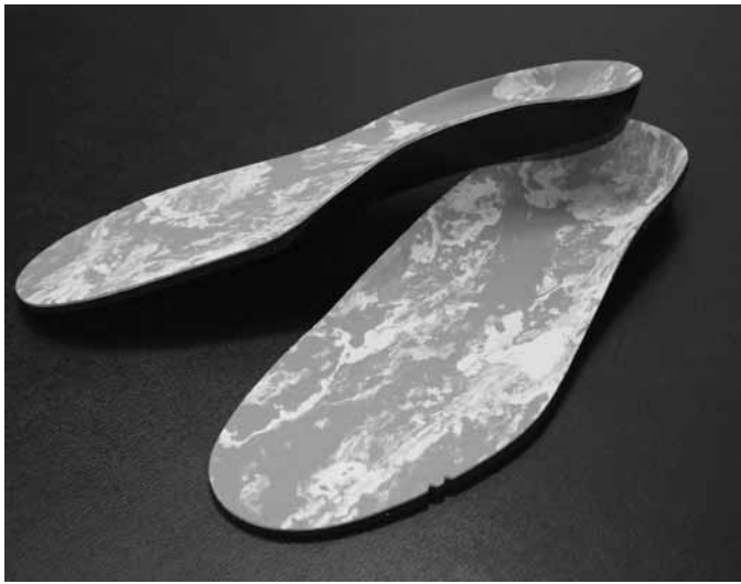
Figure 1. The prefabricated, full-length Quick Comfort Insole (Foot Management, Inc, Pittsville, MD).

conditions, we chose a general measure of postural stability to provide clinicians with an easily interpreted measure to guide clinical practice.